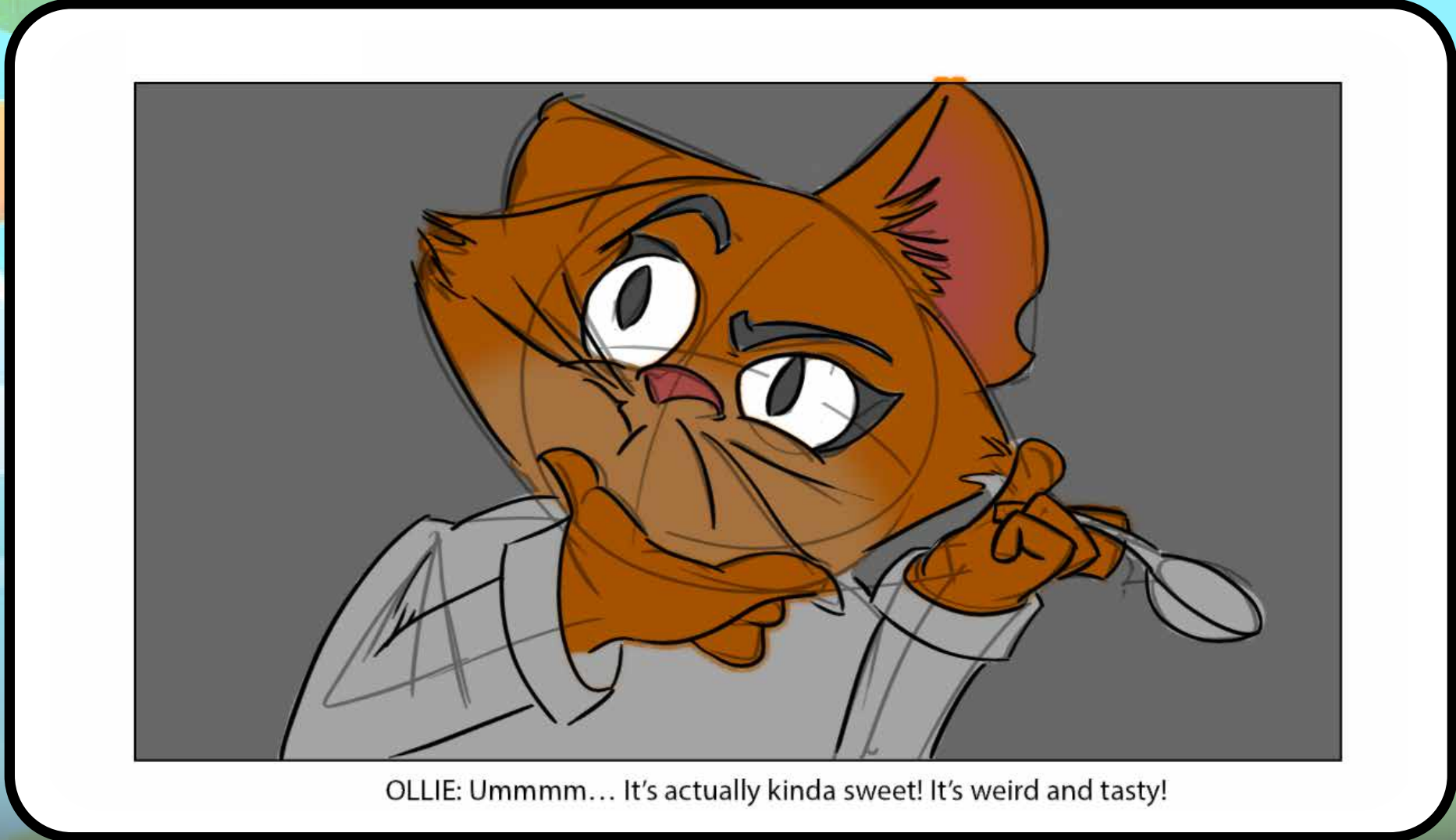
OLLIE: Ummm... It's actually kinda sweet! It's weird and tasty!