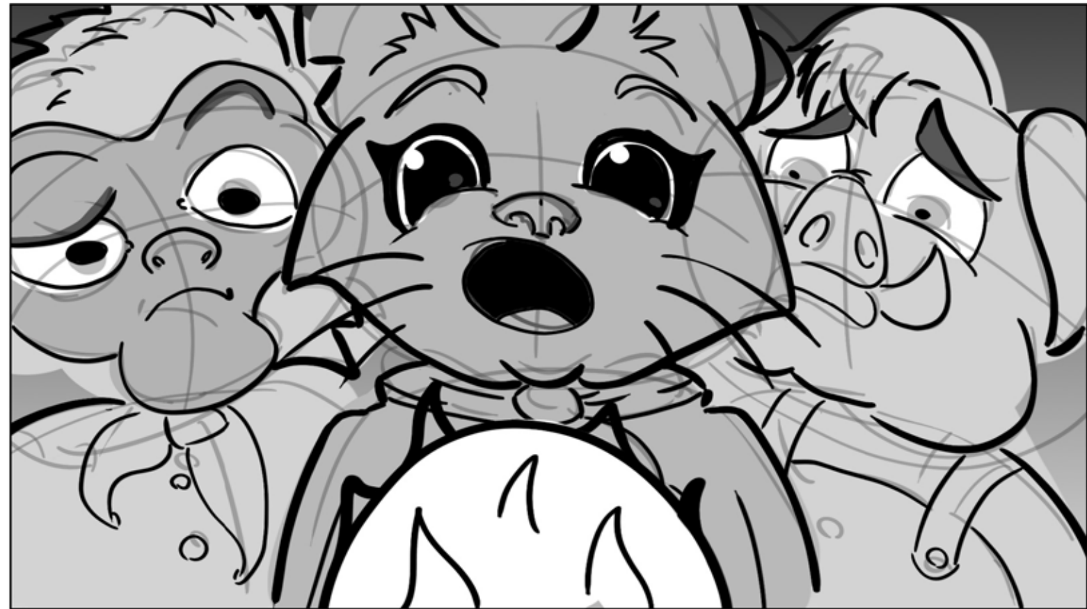
Interior - big kitchen. Ocelot, Tamarin and Warthog are together near the center (by the fridge) and the Ocelot is holding up a baseball sized scaly purple object.