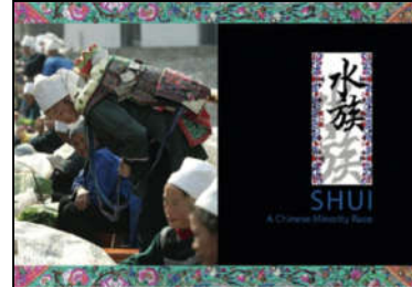
Shui, A Chinese Minority Race