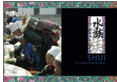
Shui, A Chinese Minority Race