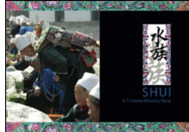
Shui, A Chinese Minority Race