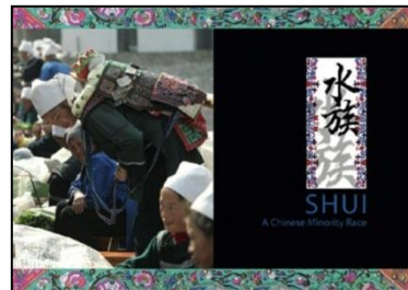
Shui, A Chinese Minority Race