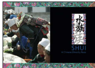
Shui, A Chinese Minority Race